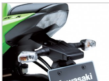
Easily removable street-use parts