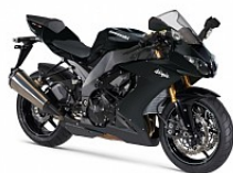
Metallic Diablo Black