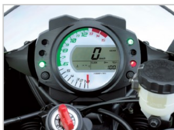
Hybrid instrument cluster