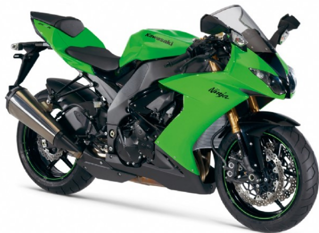
Model Year 2008

KAWASAKI'S SUPERSPORT FLAGSHIP REACHES NEW HEIGHTS