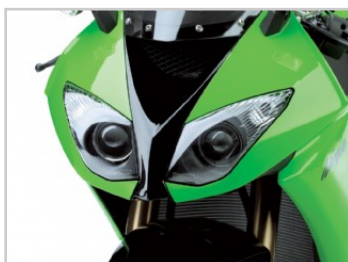
Revised RAM air