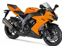
Pearl Wildfire Orange